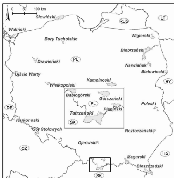
Fig. 1. Location of the park in central Europe and position of study area in the network of national parks in Poland © Tatra National Park, Poland.

An intensive bark beetle (mainly Ips typographus , rarely also Ips cembrae (Heer, 1836)) outbreak occurred between 1993 and 1998 and again between 2009 and 2013 in the Tatra Mountains of Slovakia and Poland. In Poland, the outbreak was primarily located in reserve areas where pest management or other activities were prohibited. The size of affected areas with dead stands increased from 180 ha in 2009 to 590 ha in 2012. Glades (clearings covered by deadwood or without trees) increased in same time from 50 ha to 70 ha and new growth (regrowth or young generation) from 10 to 30 ha. The biggest augmentation in above mentioned categories of affected areas in forest were registered in 2013 in Gąsienicowa Valley.